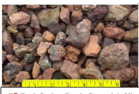
#5 Red Cedar Bark Gravel 1-3"