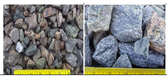
#3 Med Tah. Granite 3/4" #4 Lg Tah. Granite 1"-3"