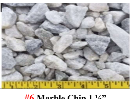
#6 Marble Chip 1 1/2"