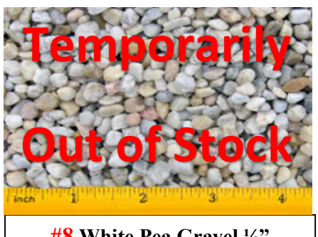
#8 White Pea Gravel 1/2"