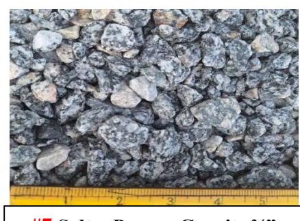
#7 Salt n Pepper Granite 3/4"