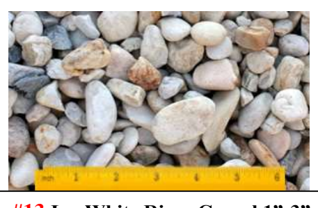
#13 Lg. White River Gravel 1"-3"